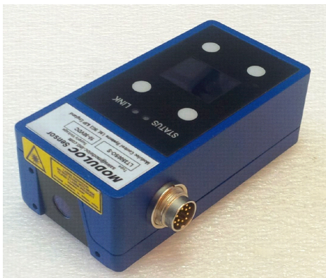
Photograph shows Sensor with all optional interfaces provided